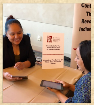
NCAI conference attendees complete a survey designed to inform tribal nations' efforts to build their data capacity.

"We now go above and beyond federal requirements to see what we need to be collecting and analyzing to see the change that we know is needed here."