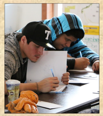
Thunder Valley Community Development Corporation's construction trainees set up bank accounts and receive credit counseling during their 10-month training program.

"We try to reach to the root of what's causing people to be unsuccessful in their life and we take our time...We want to [provide] a tool that they can put in their toolbox and use every day of their life."